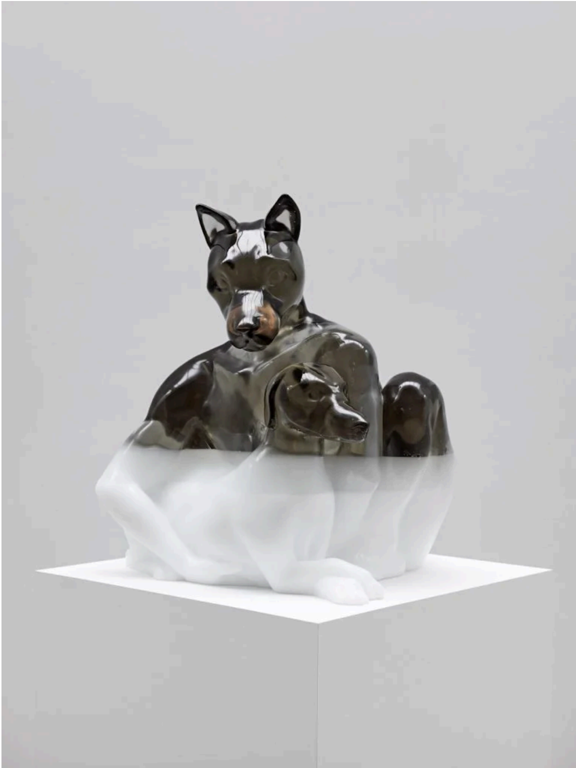
Oliver Laric, Hundemensch (2018). Courtesy of Contemporary Istanbul Foundation.

Lisbon's Pedro Cera will feature sculpture by Berlin-based Oliver Laric, whose practice translates the hallmarks of the digital age—reproduction, endless variation, and instant circulation—into tangible form.