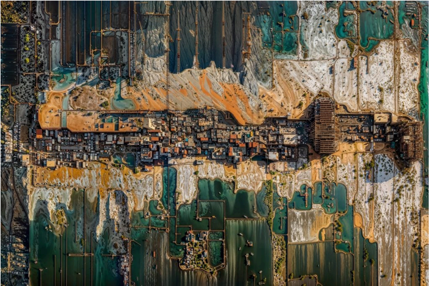
Edward Burtynsky and Alkan Avcioglu, Hypertopographics #2 (2025).

From New York, Heft Gallery presents a cross-border collaboration between acclaimed Canadian photographer Edward Burtynsky and pioneering Turkish AI artist Alkan Avcioglu, exploring the ecological and industrial complexities of the present moment through machine-assisted imagery.