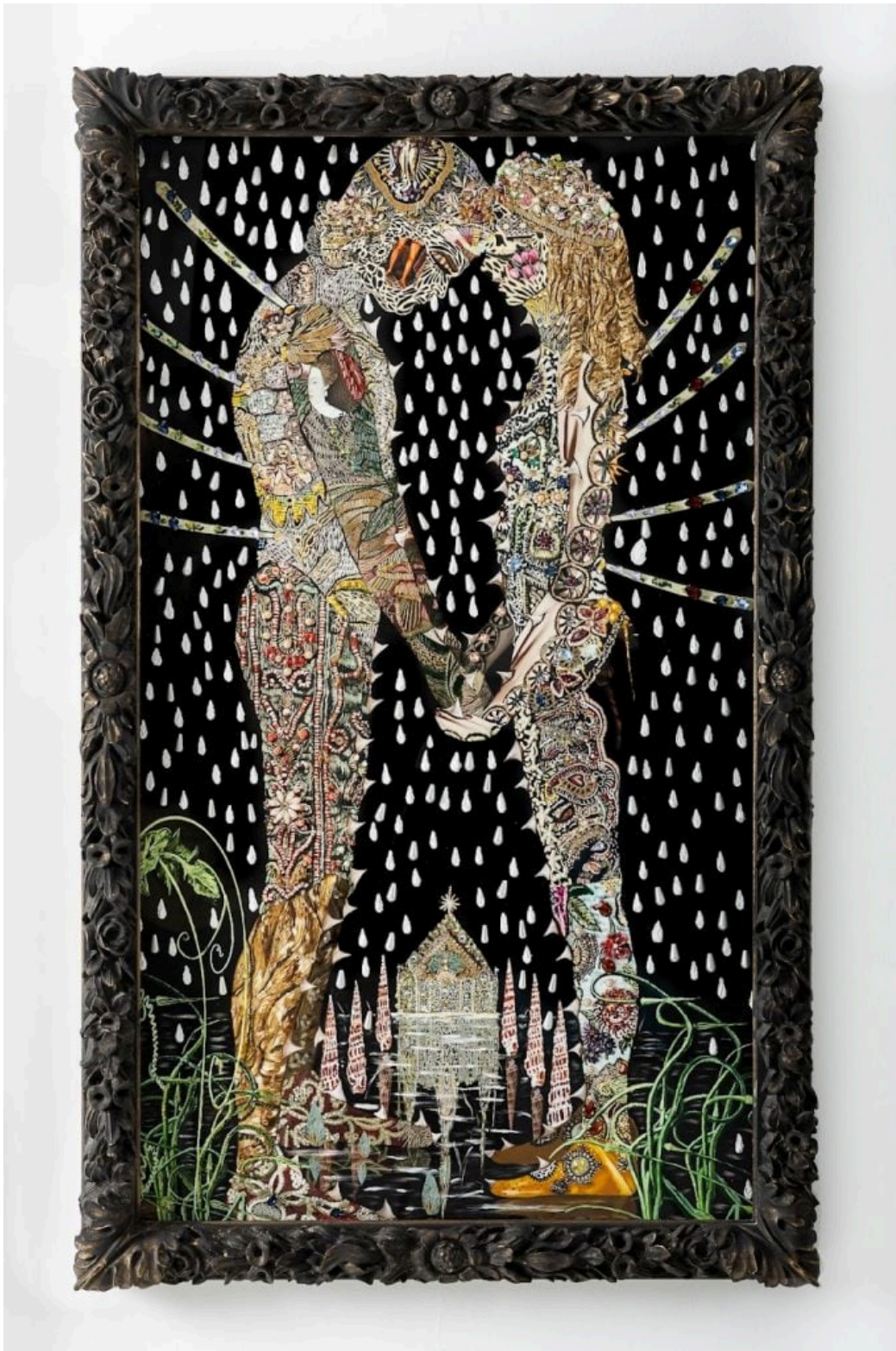
Lal Batman, Even the Roses Watched Us Bleed (2025).

Highlights this year include Pilevneli, Istanbul and Bodrum, showcasing new work by Lal Batman, whose multidisciplinary practice fuses visual chaos and cinematic storytelling with imagery from diverse temporal and cultural contexts.