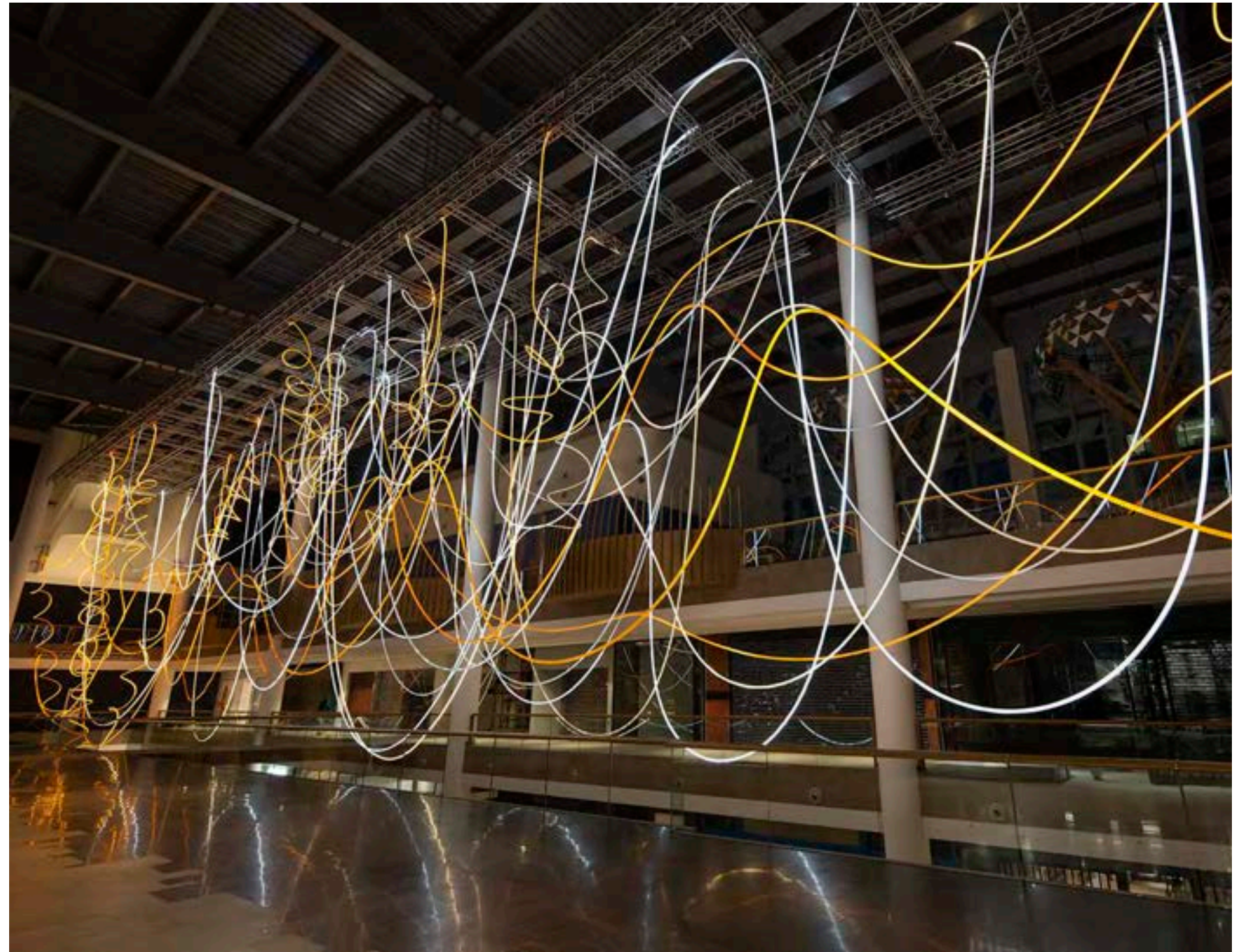
GOLDEN ARRAY, Mumbai India, Photo: Grimanesa Amorós Studio

"Light holds an ephemeral quality; it engages us emotionally and captures the imagination. As a medium it has a unique ability to bridge across cultures and diverse audiences; we all connect to light."