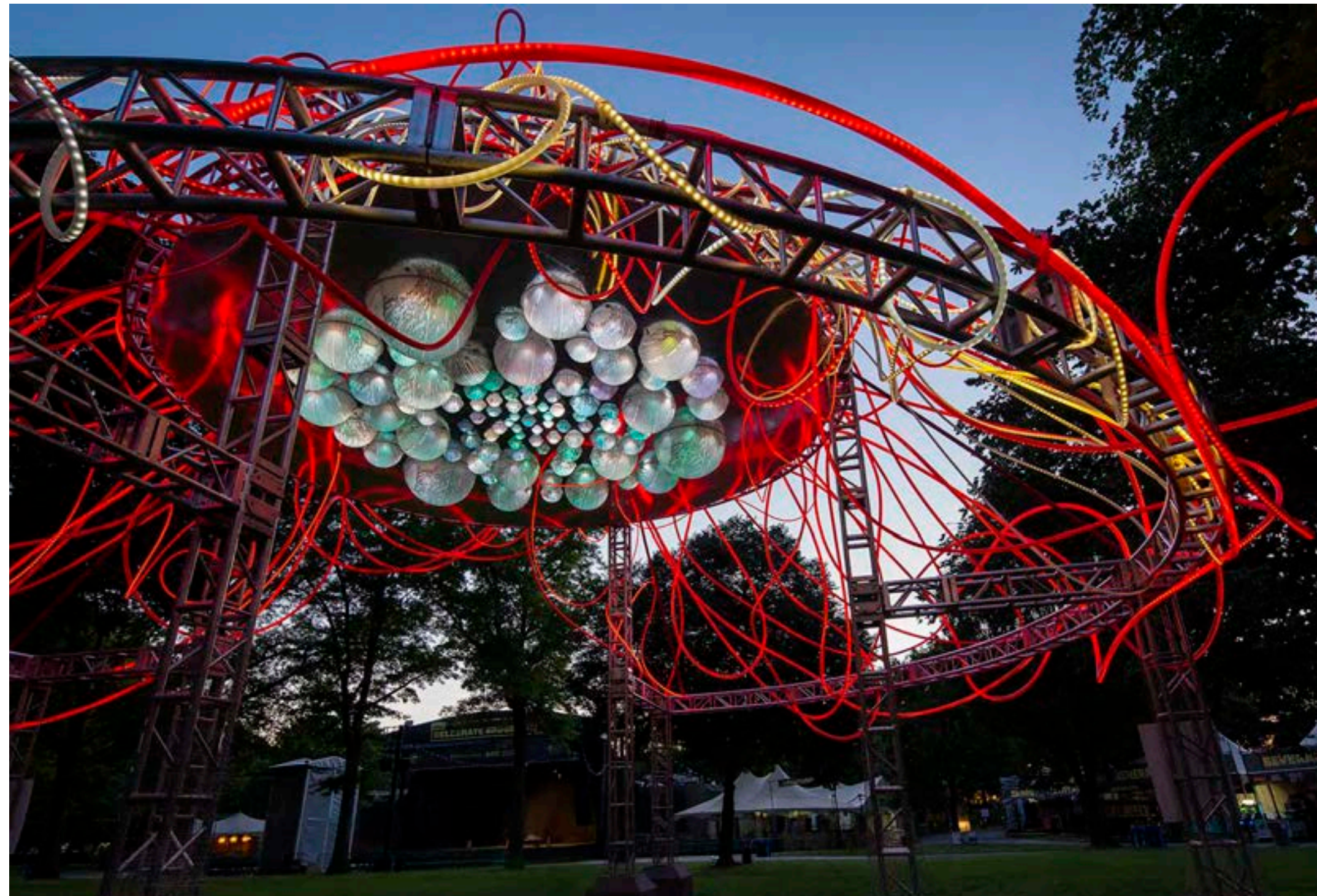
HEDERA , Brooklyn NY, Photo: Grimanesa Amorós Studio

"Art provides us with a means of accessing our emotional selves. It makes us more empathetic, giving us a space to nurture and prosper."