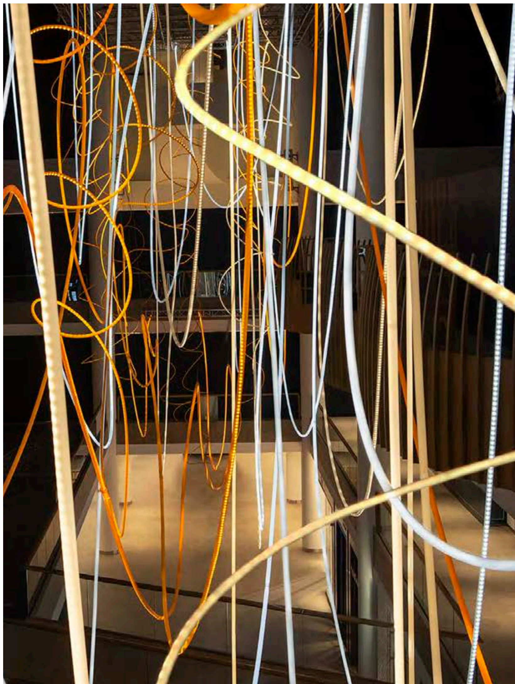
GOLDEN ARRAY, Mumbai India